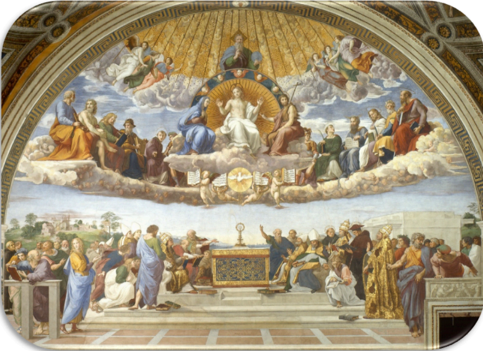
Distribution of the Holy Sacrament by Raphael