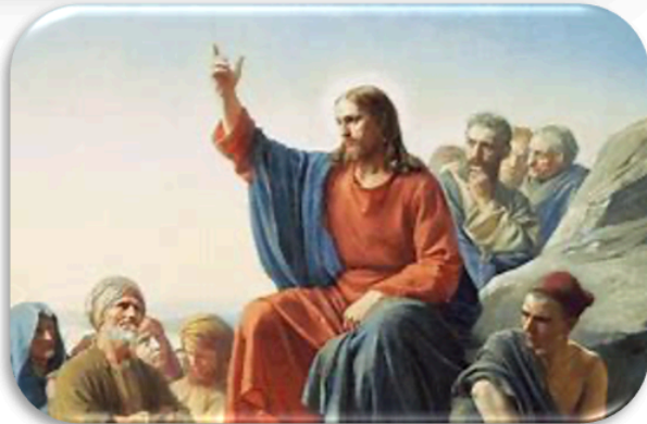
Sermon on the Mount by Carl Bloch

Gospel accounts of how the lives of men and women were changed by their encounters with Jesus. (F)