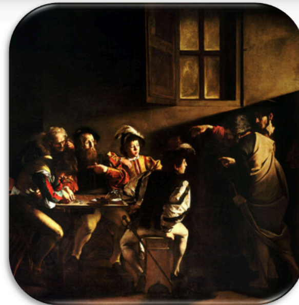
The Calling of Saint Matthew by Caravaggio

Explore responses to creation in prayer, art and music.