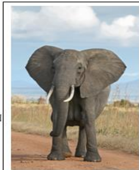
A bull elephant.

Elephants are usually very gentle but can get quite cross. Elephants are very clever and know how to find water even when it is far away. When they find water they like to swim.