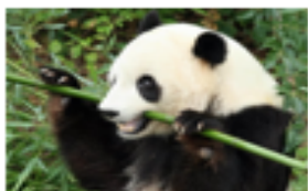
A giant panda eating bamboo.

Pandas are very fussy eaters. Most pandas only eat bamboo, a type of grass. A giant panda will eat half their own weight in bamboo every day.