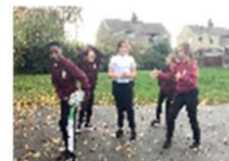
Y5 Invasion Games - Rugby