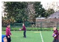
Y3 Invasion Games - Netball