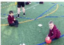
Y1 FMS - Rolling a Ball