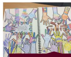
Y4 Human Rights