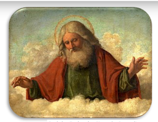
God the Father by Cima da Conegliano

Recognise the gifts and qualities God gave them and others