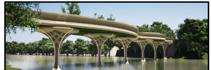
New Design Idea