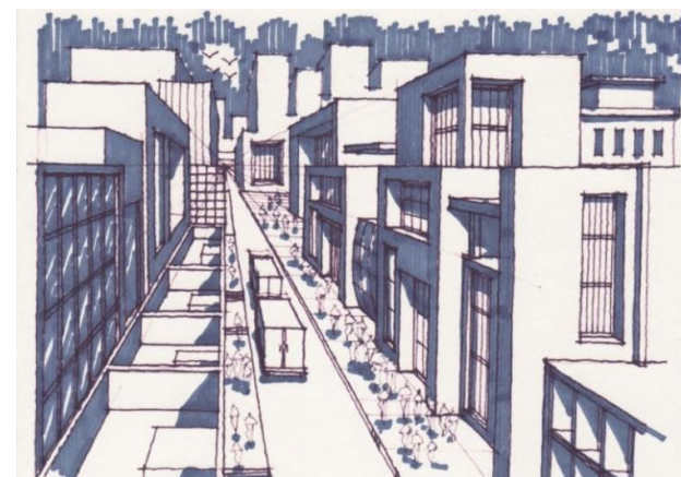
An example of 1 point perspective drawing