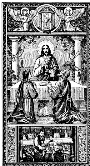
Answer to puzzle on front: Living Bread.

Of course we can't see any change happen when the priest consecrates the bread and wine, but we know that God can do things without us understanding them. He loves us so much that He wants to come to us hidden in Holy Communion. Now it is up to us to love Him back with our whole hearts!