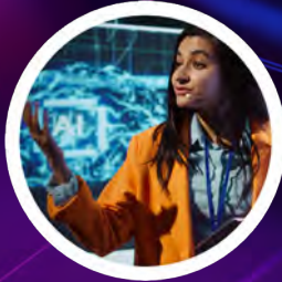
DIGITAL DELIVERY MANAGER