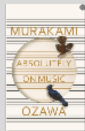
Absolutely on Music