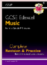
GCSE Music Edexcel Complete Revision & Practice by CGP