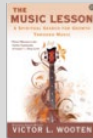
The Music Lesson