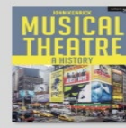
Musical Theatre: A History