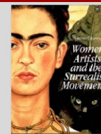
Women Artists and the Surrealist Movement