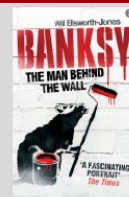
Banksy: The Man Behind the Wall