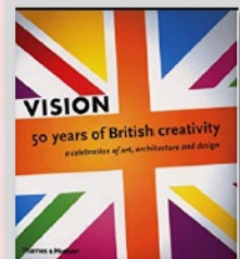
50 years of Creativity