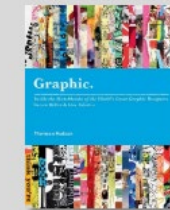
Graphic: Inside the Sketchbooks of the World's Great Graphic Designers