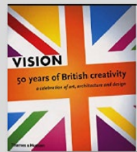
50 years of Creativity