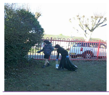
Page 3 of 7