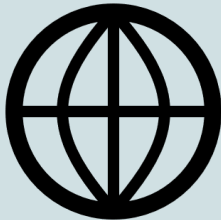
Linguascope App - Languages