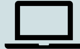
Charging Trolleys - SEND