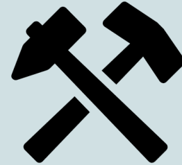
Bench Drill Press - D&T