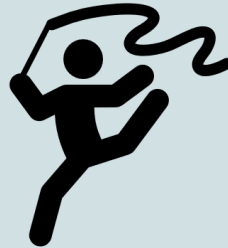
Cheerleading Mats - Performing Arts