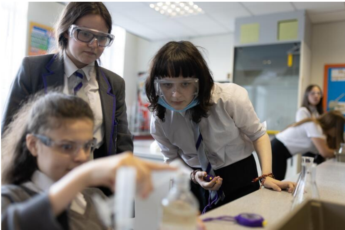
Year 11 Pre-Public Examinations