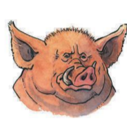
Orwell's Life & Times