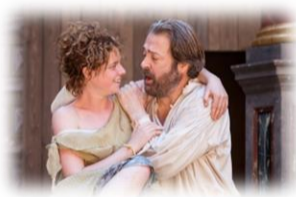
Shakespeare / The Italian State