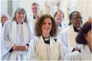
Gender roles within the church- ordination of women