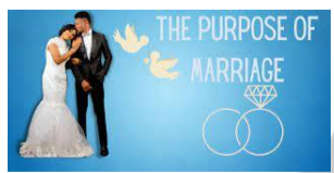
Purpose of marriage