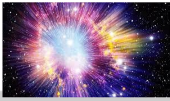
Origin of the Universe (science)