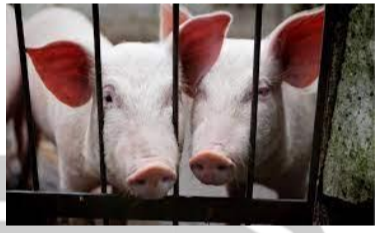
Animal rights (food, sport, RSPCA) and vegetarianism