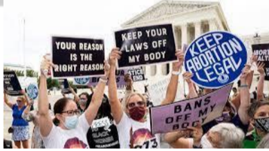
The Abortion debate