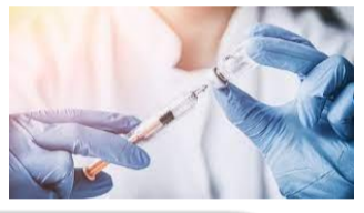
Euthanasia- Christian view