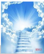
Life after death