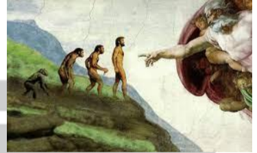
Truth (scientific verses religious)