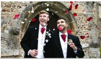
Homosexuality and same sex marriage