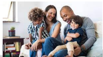
Relationships and Family