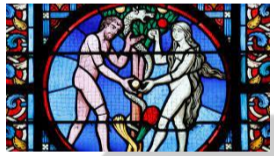
Origin of humanity (creationism verses design)