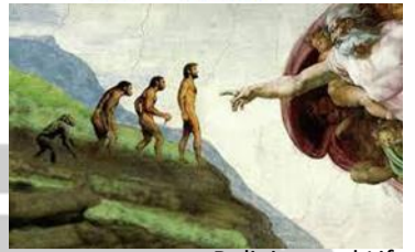
Religion and Life

Your journey continues onto further education