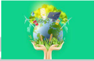
Environment and pollution incl. sustainability and conservation