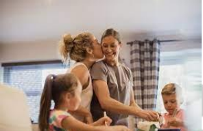
Gender roles within the family