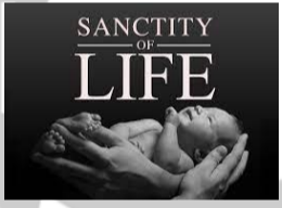
Quality versus sanctity of life