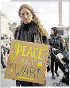
Religion, Peace and Conflict

Your journey continues onto further education