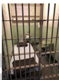
Crime and Punishment