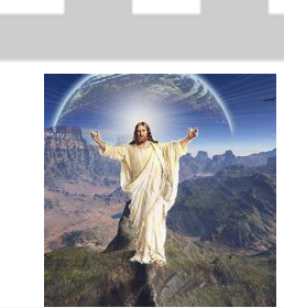
Jesus: the ultimate hero?