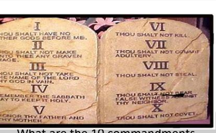
What are the 10 commandments and why are they so important to Jewish people?