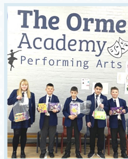
Year 7 Winners Reading Out Loud