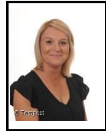
General Teaching Assistant

Staff in the Early Years team are Paediatric First Aid trained and highly trained and experienced in the Early years foundation stage.