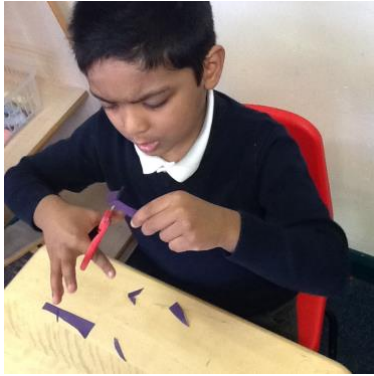
Individual work focuses on extending skills.