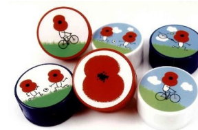
Pencil Sharpener - Suggested Donation: 50p