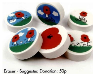
Eraser - Suggested Donation: 50p

Poppies—a variety of items available each playtime this next week - donations to The Royal British Legion.