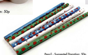
Pencil - Suggested Donation: 50p Ruler - Suggested Donation: £1.00