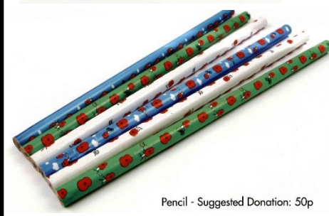
Pencil - Suggested Donation: 50p