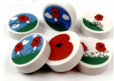
Eraser - Suggested Donation: 50p