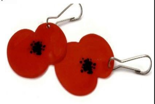
Reflector - Suggested Donation: 50p

Dean Street, Trawden, Colne, BB8 8RN Tel: (01282) 865242 www.trawden.lancs.sch.uk Email: bursar@trawden.lancs.sch.uk