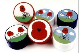
Pencil Sharpener - Suggested Donation: 50p