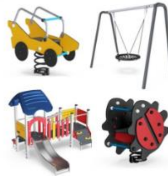
Trawden Forest Parish Council

Trawden Forest Parish Council have decided to upgrade the playground at Lanehouse Lane, and we need your input. As the playground is relatively small and is for use by children up to 12 years of age, we are limited to what can be added and the Councillors would like to know your opinion on the suggested additions to the playground. These are: 2 x inclusive springy's for younger users; 1 x toddler climbing frame; 1 x basket swing. This is the suggested layout and other improvements.