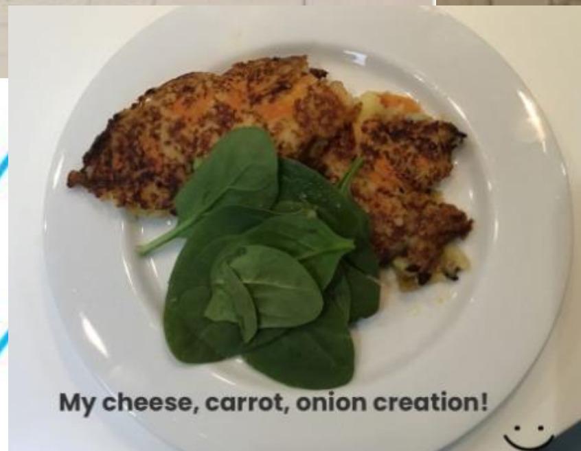
My cheese, carrot, onion creation!

English 1. The situation was different, as they were taking in a dangerous city with bombs being dropped down. 2. In the text Cliff says " Cliff loved watching " but proved he liked the Luftwaffe flying over. ... can be a sign as danger, as the people believed it to ... the planes how to get to the land and bomb them. ... was angry by the planes. She threw stones at the planes ... them, like there was ... ... the ... ... makes the top