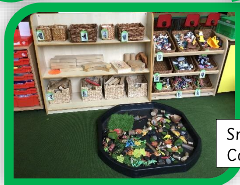
Small World and Construction