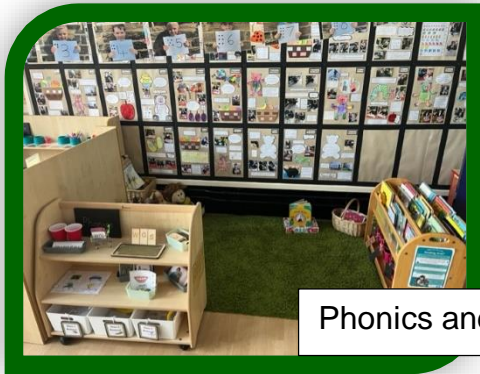
Phonics and Reading