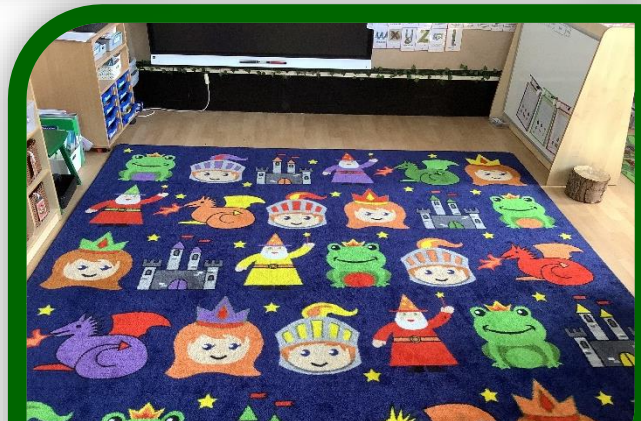
This is our carpet area. We sit here for the register, reading stories, counting and learning all together.