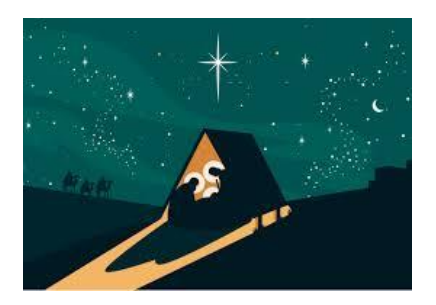
For unto us a Child is born, Unto us a Son is given;