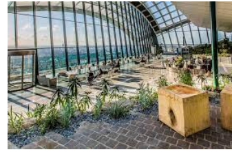
Sky Garden Bar