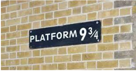
Platform 9 3/4 at King's Cross