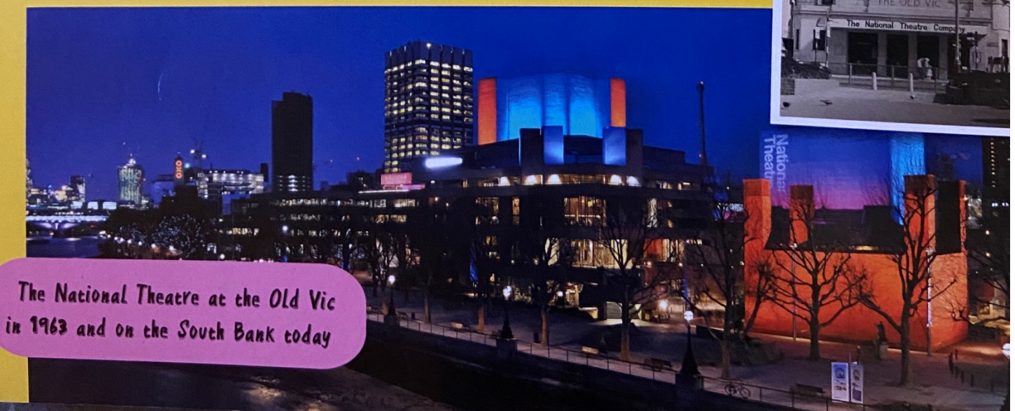
The National Theatre at the Old Vic in 1963 and on the South Bank today