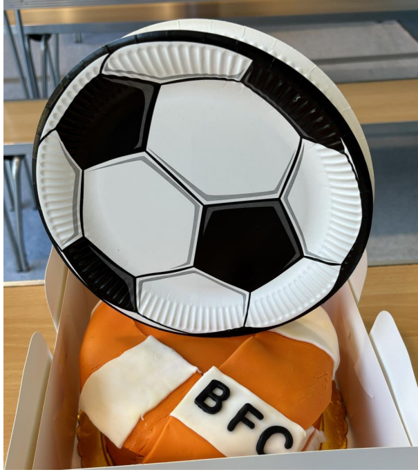
3 - ALASTAR RMT