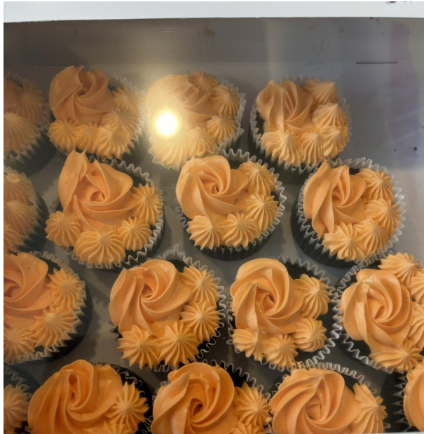
4 - UNA 3LC