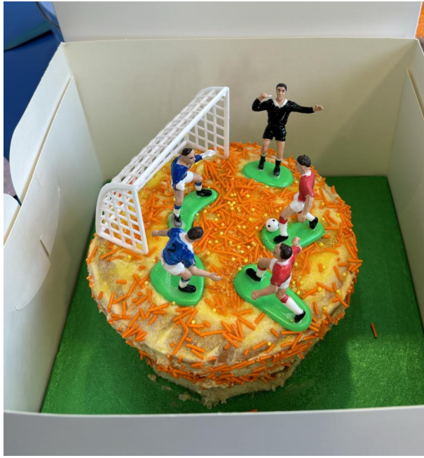
1 - POPPY 5JB