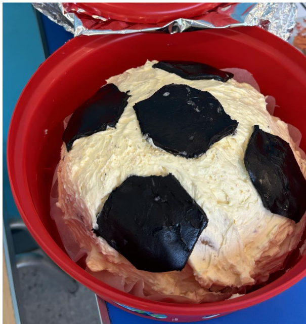
2 - LUCAS 5TT