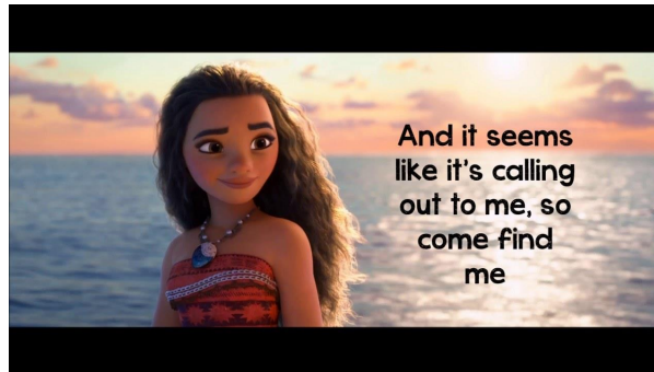
1 - Moana - How Far I'll Go (with lyrics)