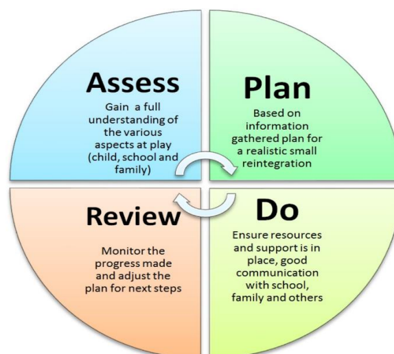
Figure 2: Assess, Plan, Do and Review Cycle (APDR)

At Unity Academy we follow the Assess-Plan-Do Review cycle to monitor the impact of interventions, helping our staff to develop a growing understanding of pupil’s needs and effective ways to support pupils with SEND.