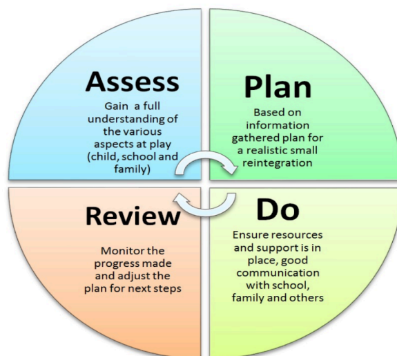
Figure 2: Assess, Plan, Do and Review Cycle (APDR)

At Unity Academy we follow the Assess-Plan-Do Review cycle to monitor the impact of interventions, helping our staff to develop a growing understanding of pupil's needs and effective ways to support pupils with SEND.