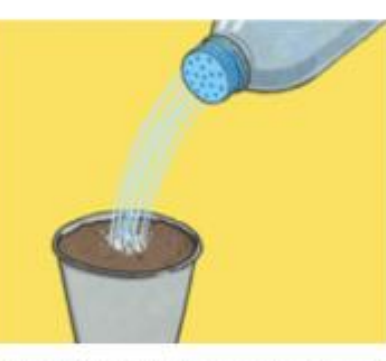
Step 5: Sprinkle enough water over the soil to make it damp but do not over-water the seed.