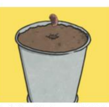
Step 2: Drop the bean seed into the hole vertically.