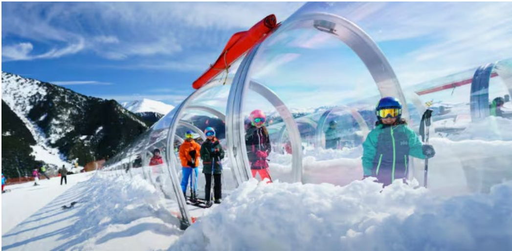
Vallnord Ski Area - Pal-Arinsal