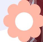
Angie & Libby's tiny home

We can begin celebrating difference and championing an anti-racist outlook from day one. You've thought about the physical books and resources in