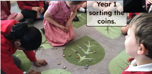
Year 1 sorting the coins.