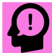
Significance And Interpretation

And finally, remember, we are teaching children to be historians, not fact machines.