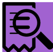
Using Sources As Evidence