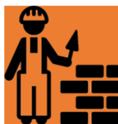
Constructing The Past

In ALL lessons, the key skills logo needs to be displayed and discussed. What does the skill mean? What might we be doing today? When did we last use the skill? How does this link to what a historian might do?