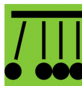
Cause And Effect