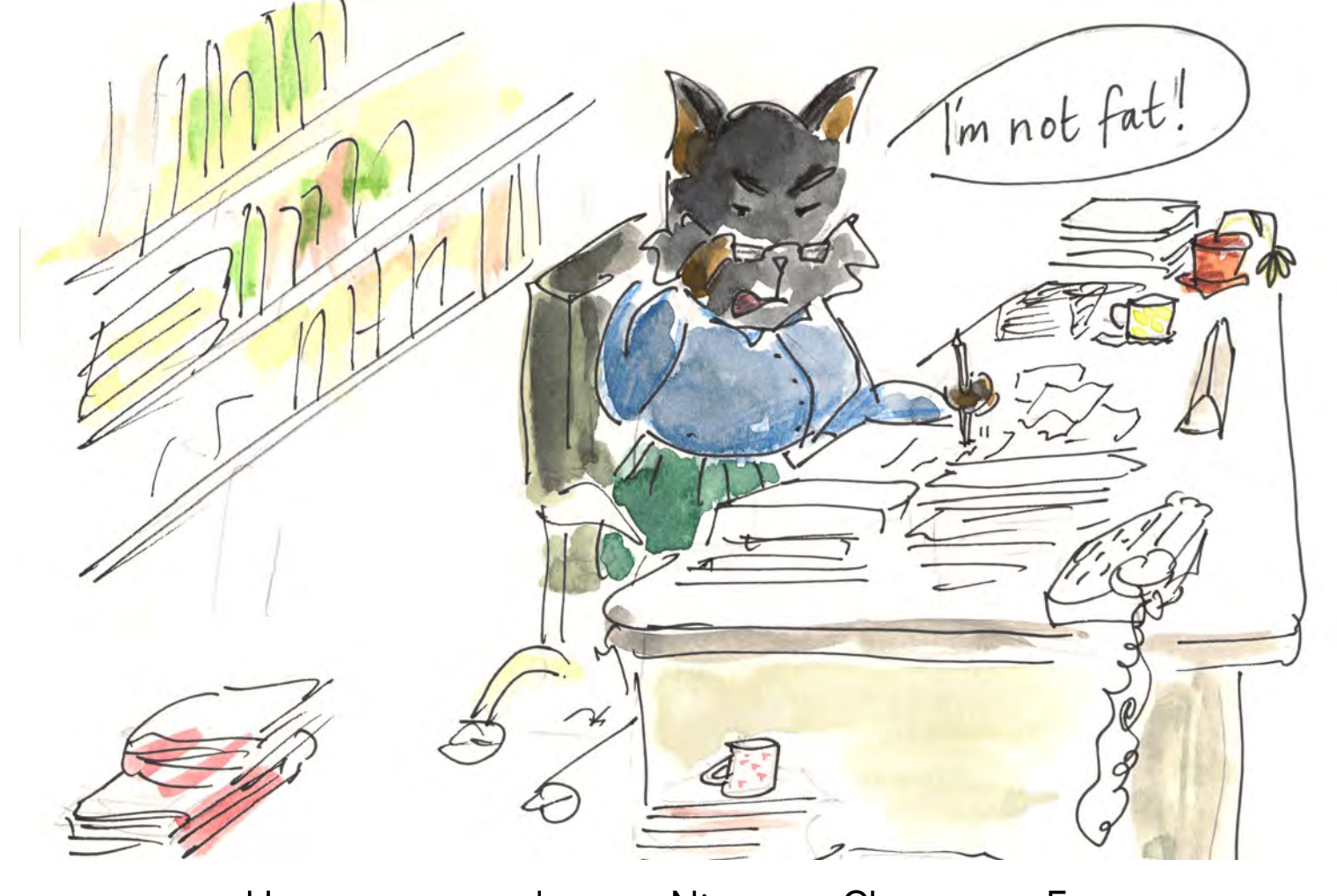
He goes to see the cat. Nice cat. Clever cat. Fat cat.