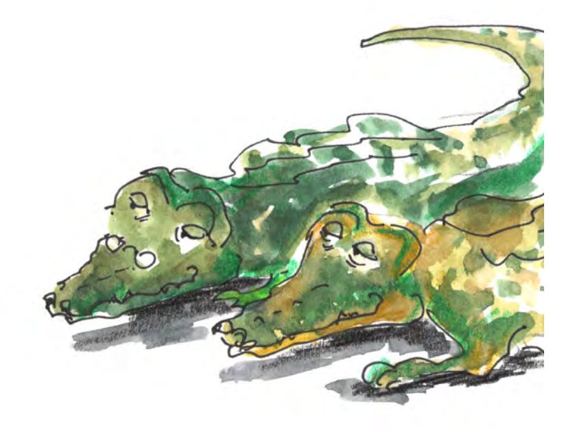
The Red Gold Dragon sits down in front of a bunch of old crocodiles. He begins.

"Once upon a time there was a Little Story Who Didn't Want To Be Told..."