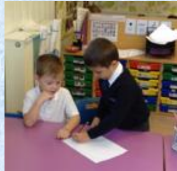
Sharing and explaining ideas