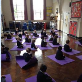
Developing attention and concentration