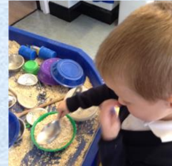
Responding to others and asking questions