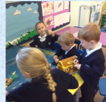
Telling stories and imaginative play