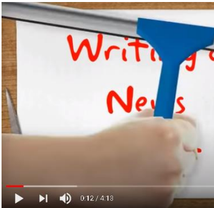
Creating a News Report - YouTube