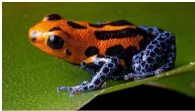
Poisonous Dart Frog

Today we are going to research and plan an information text on different rainforest animals. Here are a few to get you started. Choose your favourite and research facts about that one.