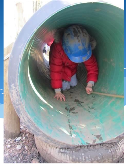
Blindfold Mud Trail