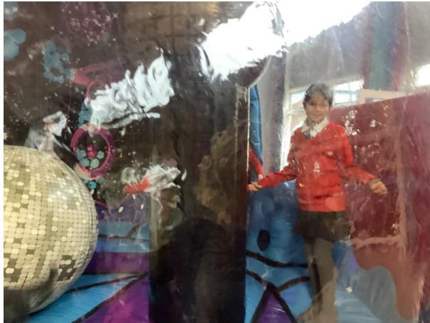
Year 4 Photos Xmas Fun Day