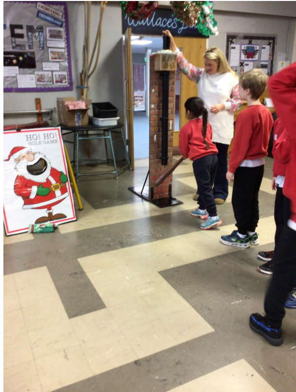
Year 5 - Xmas Fun Photos