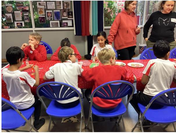
Year 6 Photos Christmas Fun Day