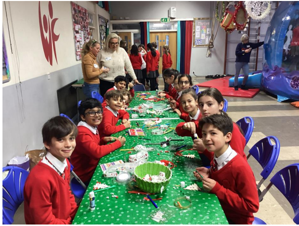
PTA Christmas Panto Photos 'A Christmas Carol'.