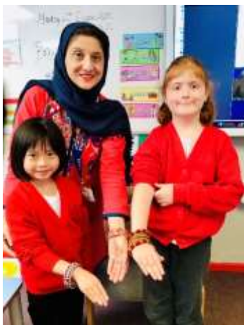
Year 3 learning about Pakistan on Diversity Day last week.