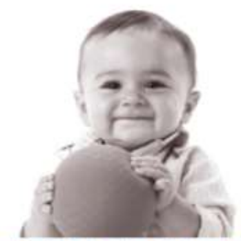
check out family links, or guk

"It was a completely new experience for me but after the first week I was completely relaxed"